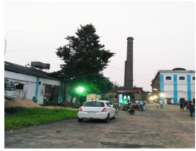
The premises of the Loomtex Jute Mills on Bishwakarma Puja Day.