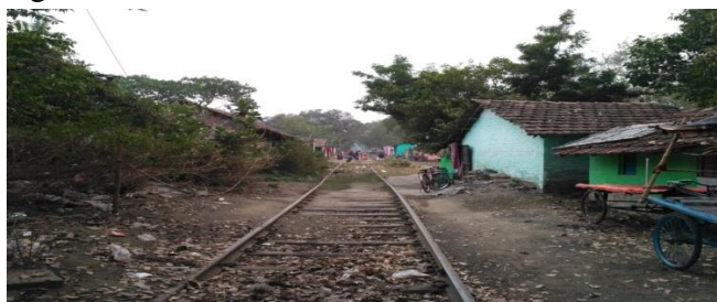
Image of the coolie-lines by the largelydefunct industrial rail siding in Titagarh Bazar.

regional lines. This can be vividly observed via the nomenclature of the lanes in the coolie-lines. Names like 'Bihari-patti'<sup>4</sup>, 'Bangali-patti', 'Allahabad-patti', 'Odiyapatti' and 'Madrasi-patti' demarcate the regions which the residents come from.