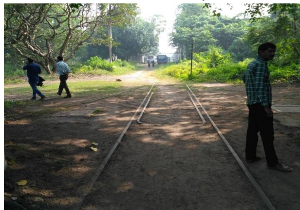
Railroad tracks which connected the jute mills in Titagarh, fallen into disuse.

selling metal utensils lay huddled on either side of the lane. As we move on, we come across a four-way crossing. Here the Titagarh Bazar ends. A left turn takes us back to the Barrackpore Trunk Road, while a right takes us to the banks of the Hugli river. But as we move straight on, the roads suddenly give way to a shock of crumbling shanties on either side. On the backdrop of these buildings loom the abandoned remains of the once-mighty Titagarh Jute Mills No 1. The shock of shrubs atop both the silent towering red brick boilers, abandoned and decrepit empty godowns with crumbling roofs and walls and fragments of railway tracks peeking out from underneath the cracks of the concrete roads tell a story of despair, waste and political betrayal... unrelenting reminders of the murder of one of the greatest industrial zones in the history of India.