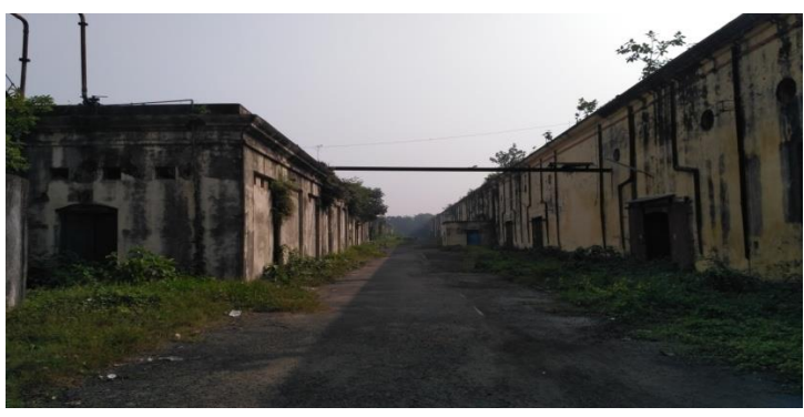
A glimpse of the abandoned premises of the Titagarh Jute Mills No 1.